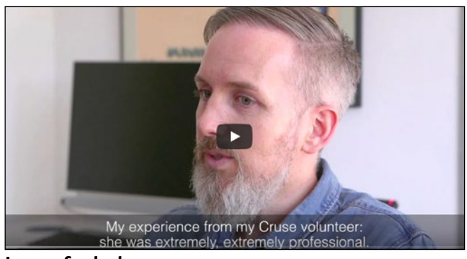
Loss of a baby